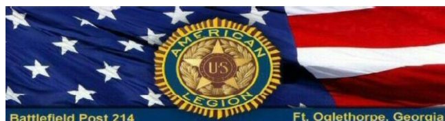
Battlefield Post 214 Ft. Oglethorpe, Georgia

All proceeds support veterans and their families. Contact Us: 706-866-3992 or www.legionpost214.org